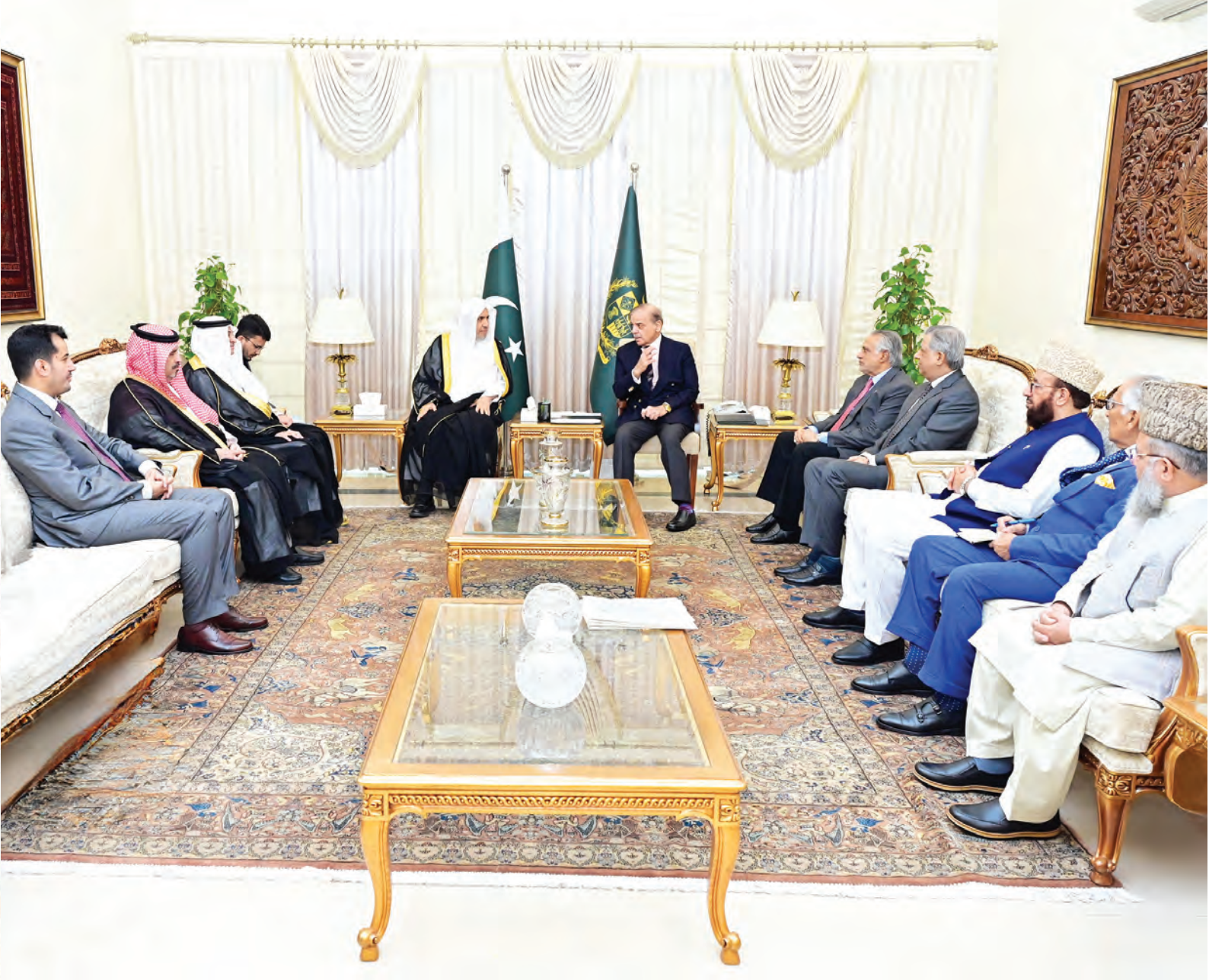
The Secretary General in discussion with Prime Minister Muhammad Shehbaz Sharif during their meeting in Islamabad.