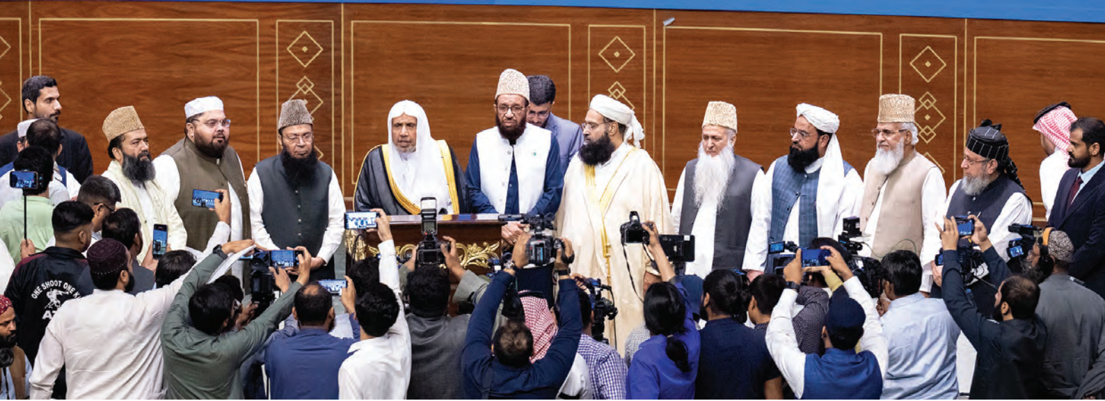
Dr. Al-Issa addresses the media at the Second Consultative Meeting with Pakistani Religious Scholars in Islamabad.