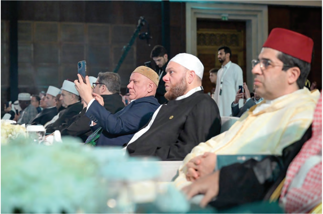
The launch ceremony was attended by senior scholars from across the Muslim world including representatives of Islamic bodies and organizations and a distinguished group of experts in Islamic affairs.