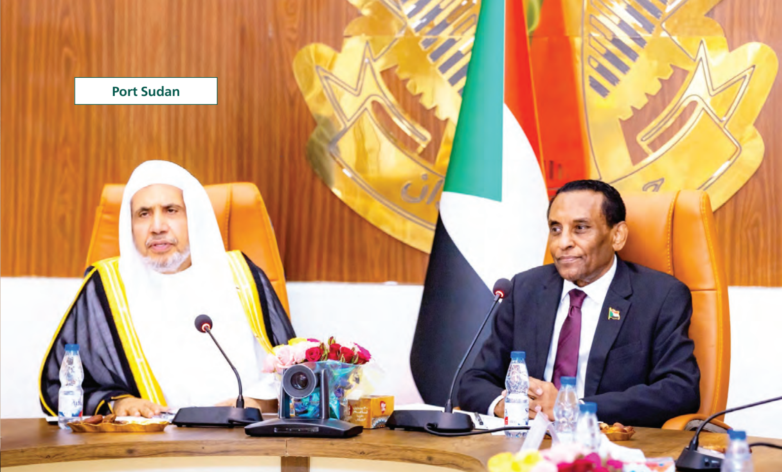
Dr. Al-Issa and Prime Minister Kamil Idris during their official meeting in Port Sudan.