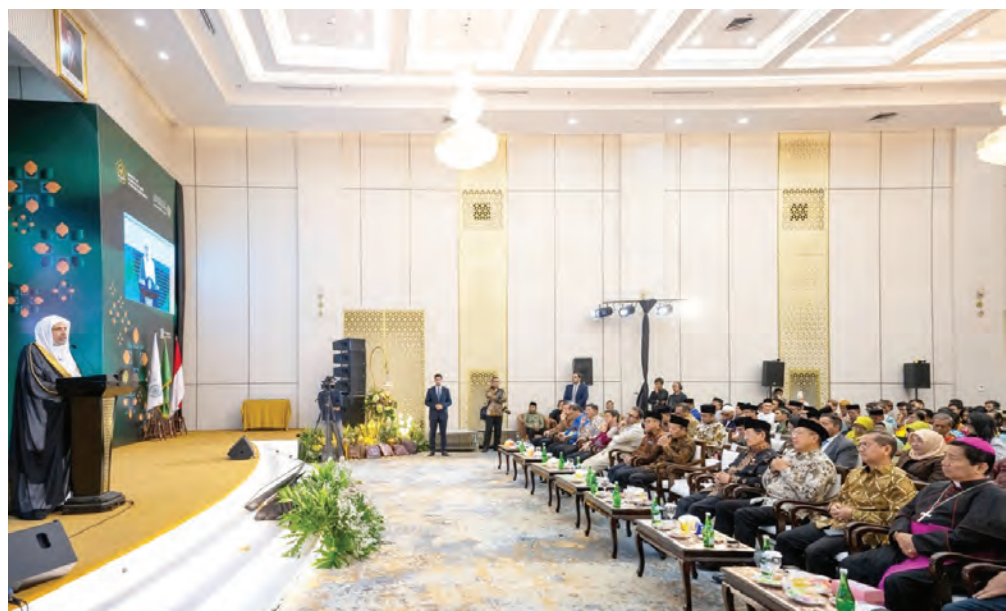
The Secretary General noted that many unjust wars throughout human history have been superficially attributed to religion despite not reflecting its genuine humanitarian teachings.

The conference also featured contributions from representatives of Indonesia's diverse religious communities, each highlighting the teachings of their respective faiths on social harmony. ■