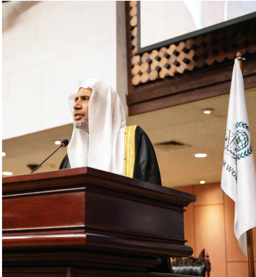
Dr. Al-Issa addresses the Indonesian People's Consultative Assembly at its headquarters in Jakarta.