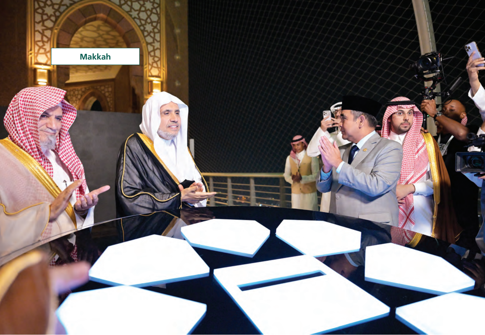
The Secretary General leads the ceremony to launch the MWL's new Minhaj digital platform in Makkah.