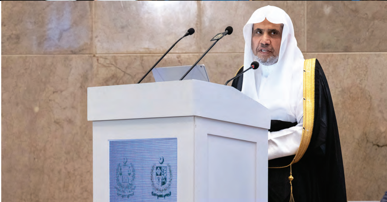
The Secretary General delivers a lecture at the Supreme Court of Pakistan.