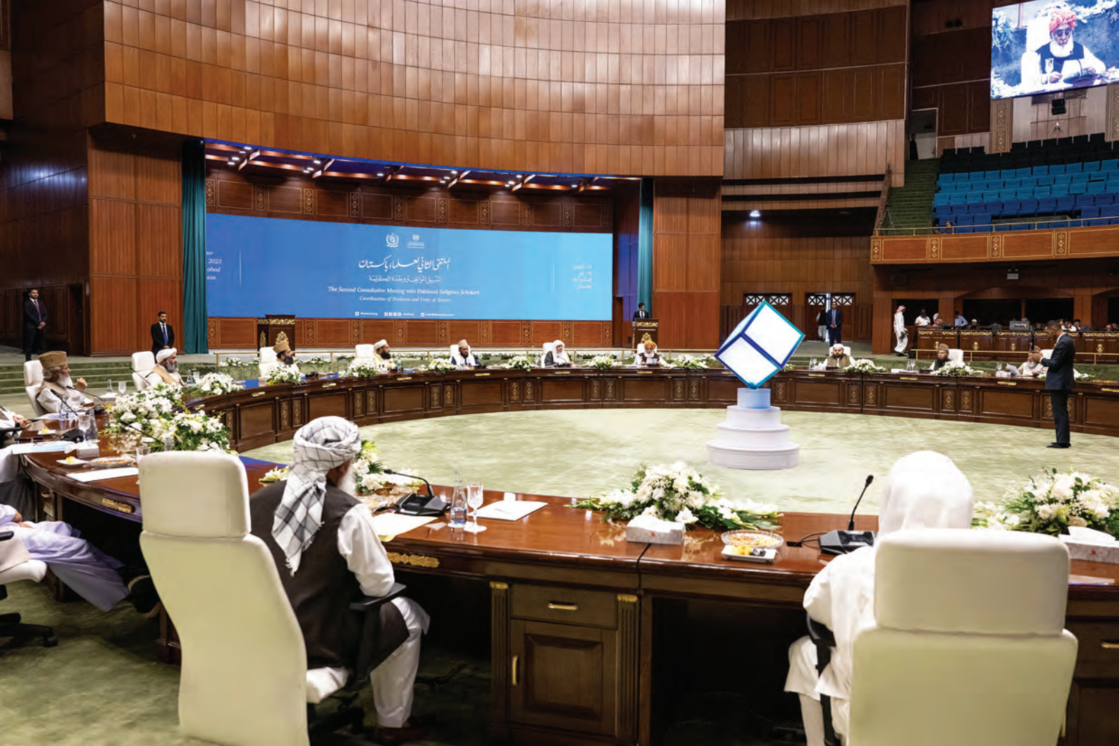
The conference was held under the theme Coordination of Stances and Unity of Word in the presence of a large gathering of senior scholars from across Pakistan representing various schools of thought.

Unity of Word,” in the presence of a large gathering of senior scholars from across Pakistan, representing various schools of thought. Dr. Al-Issa noted the meeting is part of key efforts to implement the principles outlined in the Charter of Building Bridges Between Islamic