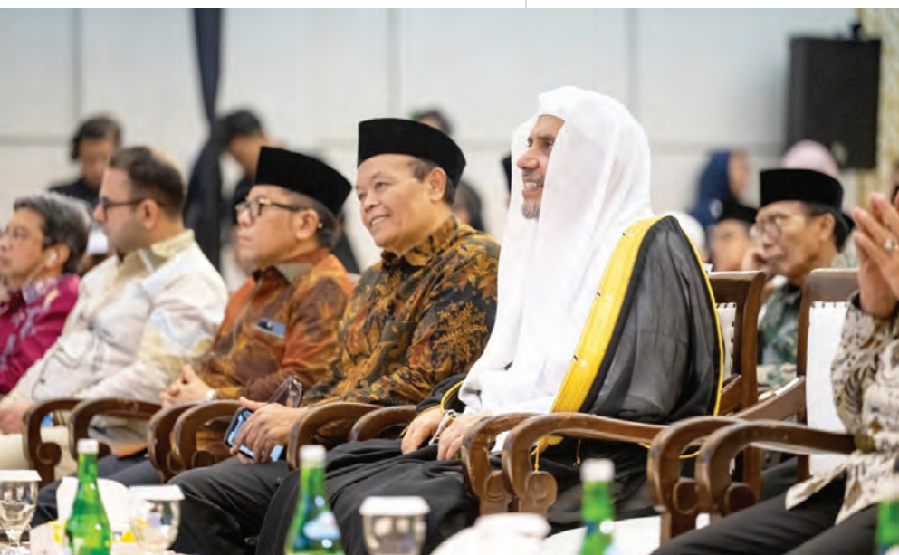
The Secretary General listens to contributions from representatives of Indonesia's diverse religious communities.

ministry officials, academics, religious leaders, and representatives of religious communities from across Indonesia's provinces—took part in the conference.