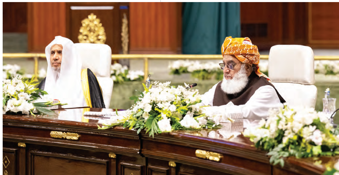
Dr. Al-Issa noted the conference seeks to reaffirm that the diversity of scholarly reasoning within its legitimate framework constitutes one of the virtues of Sharia and reflects its tolerance and breadth.

Unity of Word,” in the presence of a large gathering of senior scholars from across Pakistan, representing various schools of thought. Dr. Al-Issa noted the meeting is part of key efforts to implement the principles outlined in the Charter of Building Bridges Between Islamic