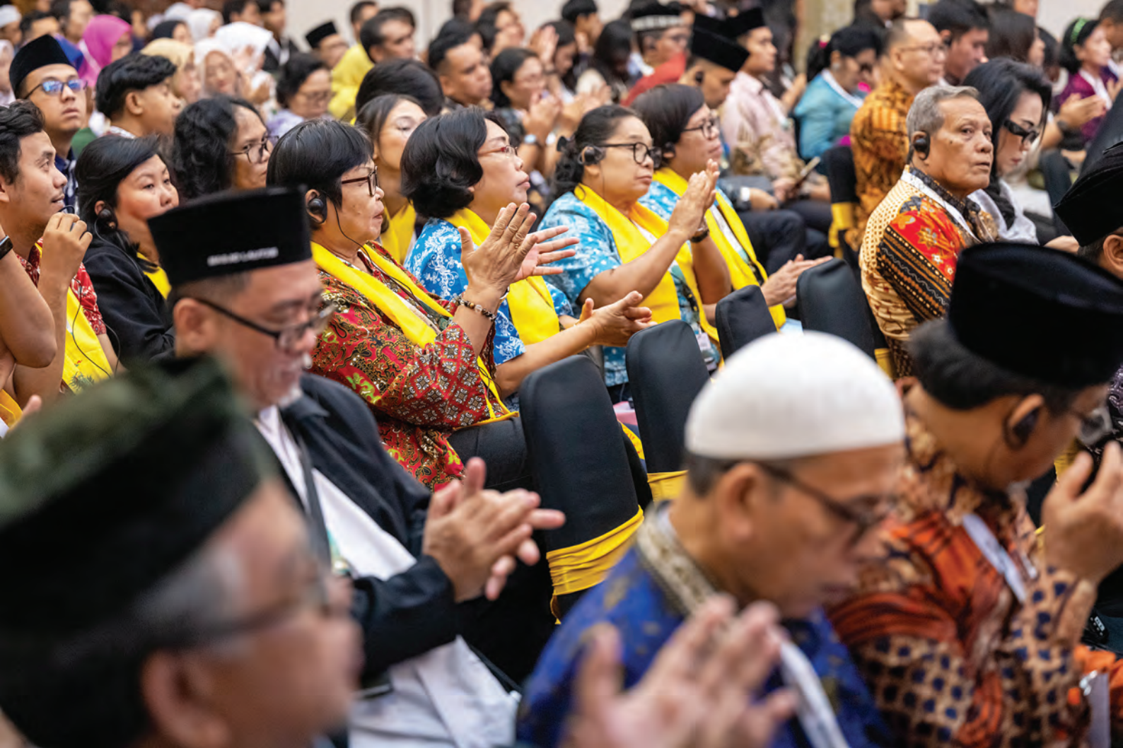
A section of the audience attending the Interfaith Harmony Conference in Jakarta, which brought together more than 350 participants from across Indonesia.

particular, and on global peace more broadly. He noted that many unjust wars throughout human history have been superficially attributed to religion, despite not reflecting its genuine humanitarian teachings.