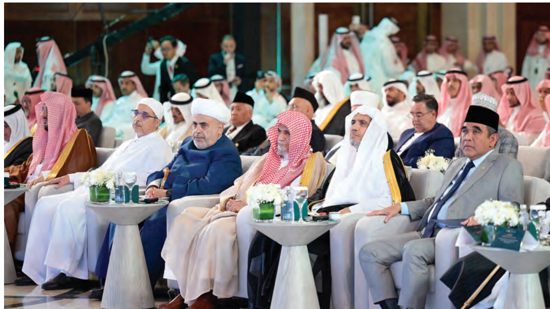
Scholars and guests attend the launch ceremony at the MWL's headquarters.