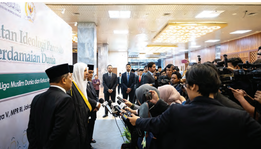
The Secretary General addresses the media after concluding his dialogue with Indonesia's MPR.

Islamic and human commonalities and on ways to strengthen coexistence and cooperation in religiously and ethnically diverse societies. He highlighted the inclusive spirit and core values of Islam.