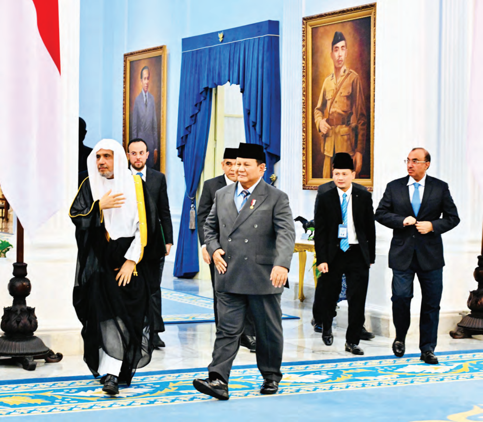
The Secretary General is received by President Prabowo Subianto at the Presidential Palace.