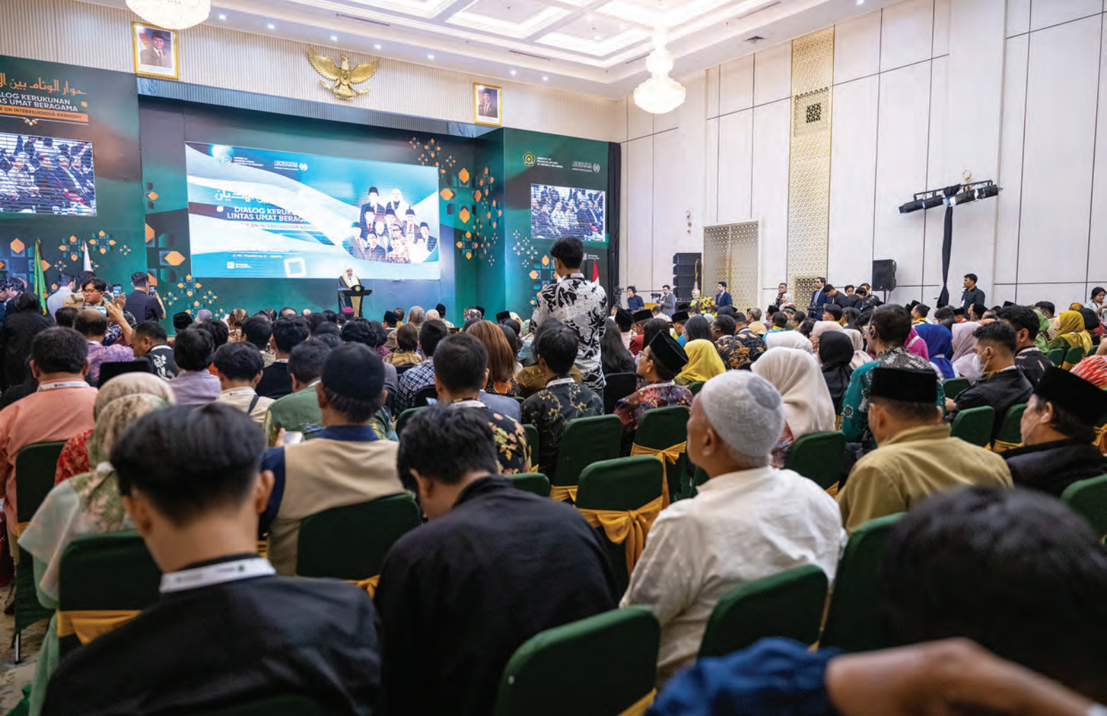
Representatives of Indonesia’s diverse religious communities attended the conference.