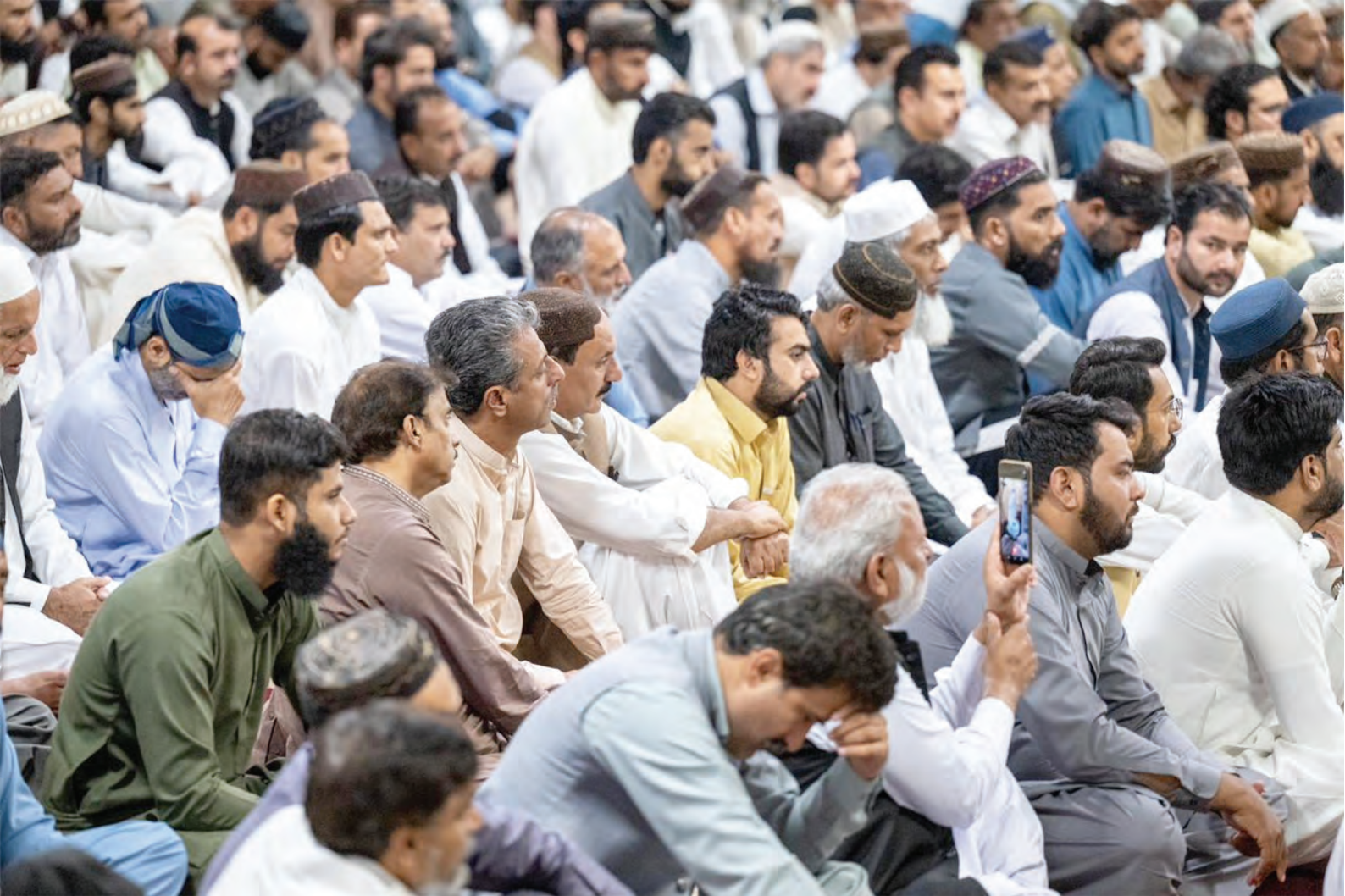
The sermon was attended by a large congregation of worshippers.

firmly established common values, and warned against the dangers of discord and division. He commended Pakistan's model for fostering cohesion and inclusivity.