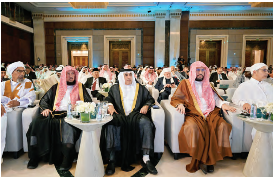
A section of the audience is listening to the presentation during the launch.

of the Minhaj application has received official approval from the Islamic Fiqh Council, whose leadership and membership include eminent muftis and senior scholars from across the Muslim world.