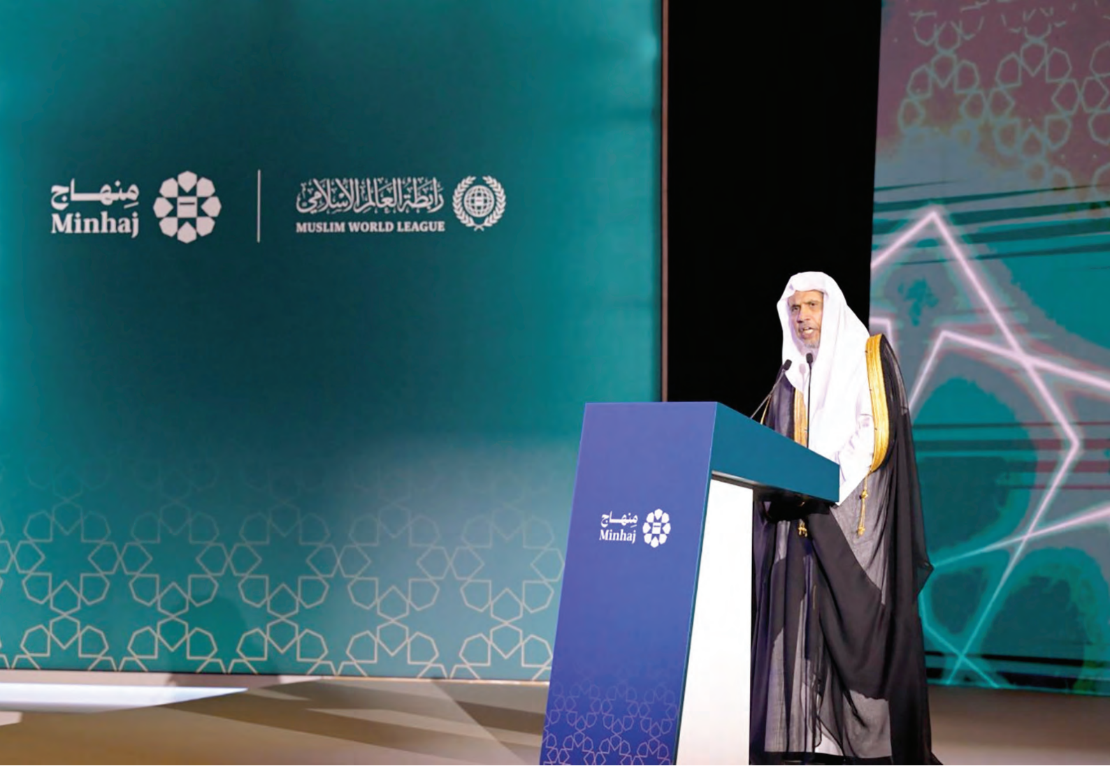
Dr. Al-Issa addresses the guests at the Minhaj launch ceremony at the MWL's headquarters.

strategic plans to enhance engagement with Muslim communities both within and beyond the Islamic world.