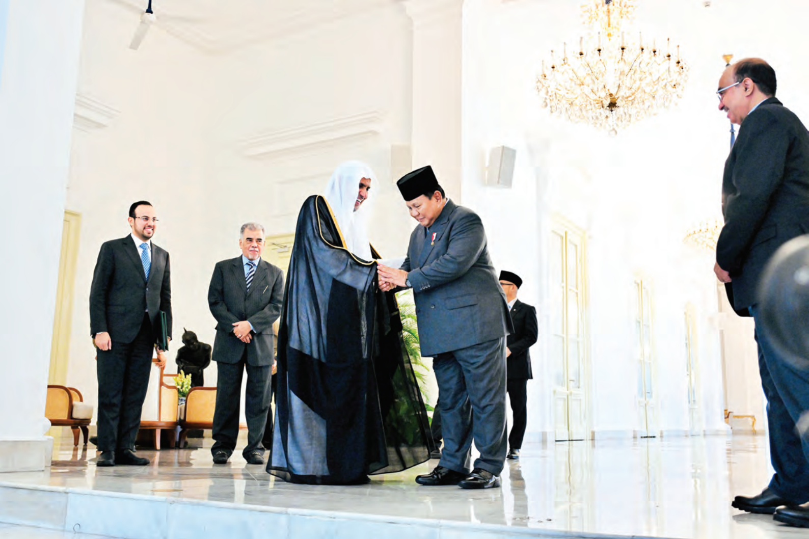
Dr. Al-Issa and President Prabowo Subianto exchange a handshake at the end of their meeting in Jakarta.