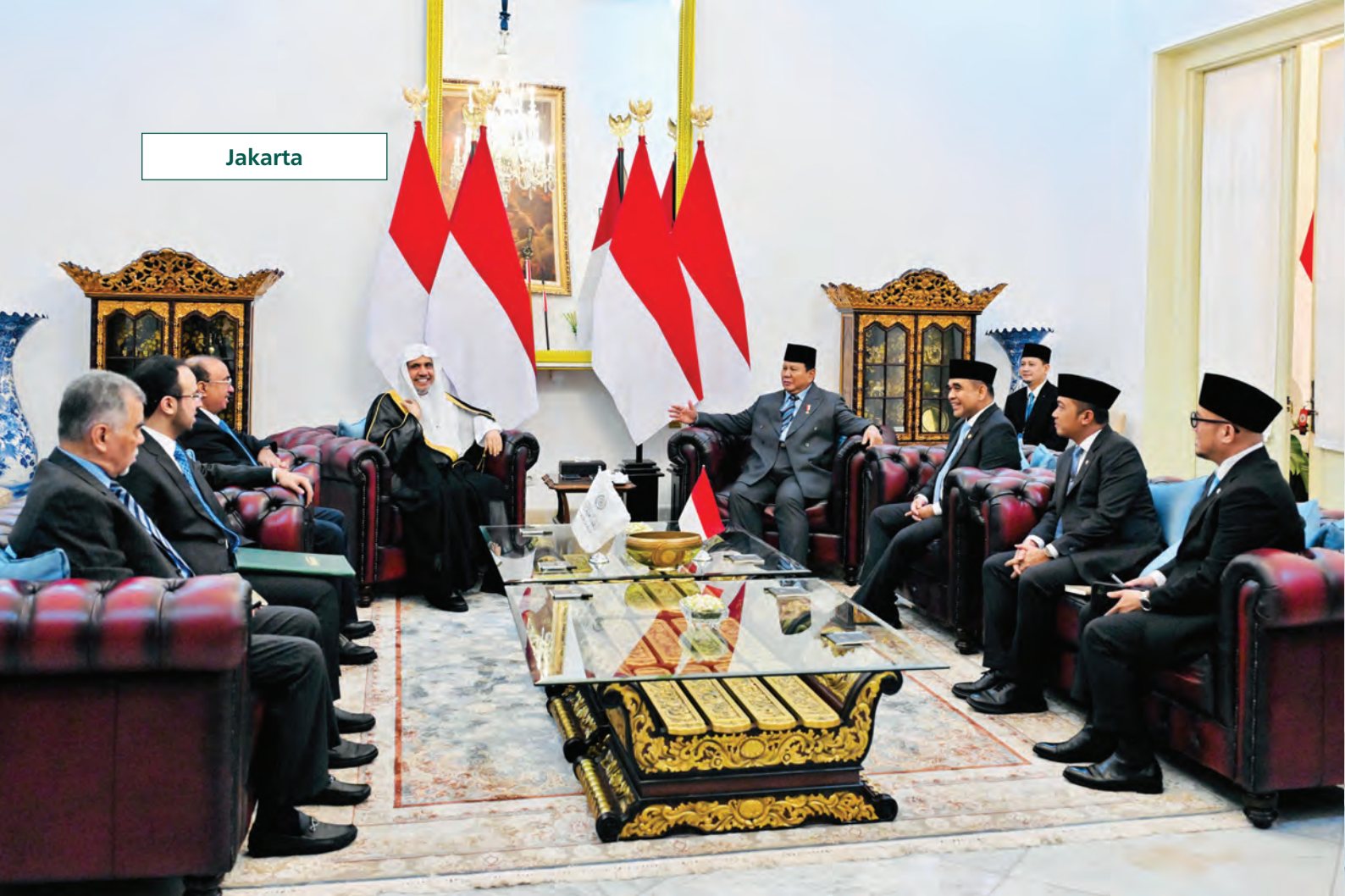
The Secretary General and President Prabowo Subianto lead discussions in Jakarta in the presence of MWL and Indonesian officials.

discussion also touched on the themes of Dr. Al-Issa's March 15 address at the United Nations in New York, delivered at the request of the General Assembly.