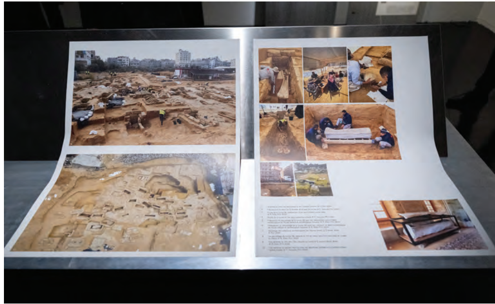
A photograph on display at the Gaza exhibition.