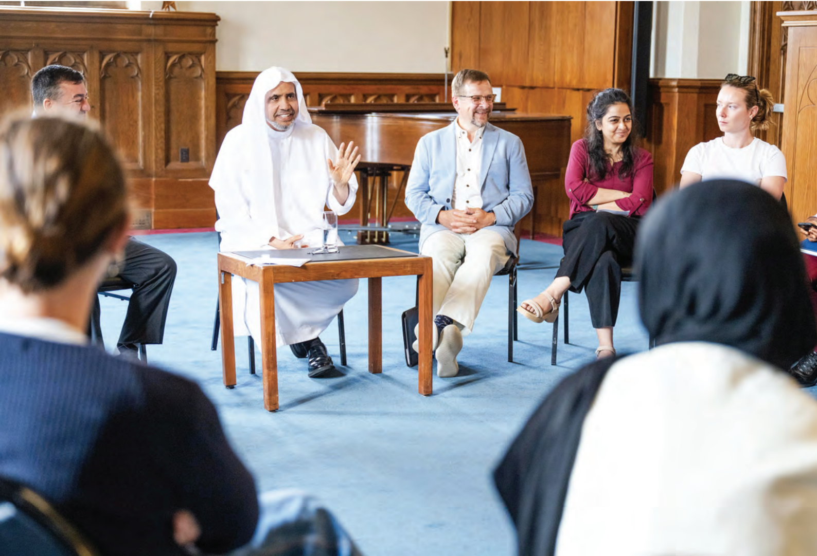
Dr. Al-Issa answers questions about the lecture and other topics from academics and students after his address.