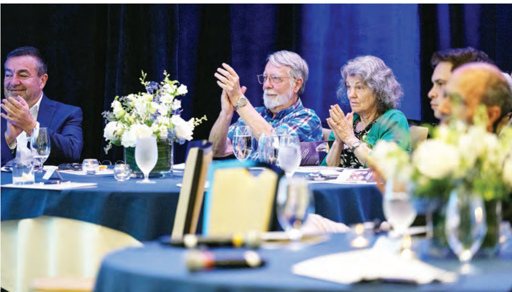
The event was attended by prominent academic leaders from Duke University including deans and faculty members as well as a number of students.

ing was signed between the Geneva Islamic Cultural Foundation and Duke University's Divinity School to expand their partnership. The MoU seeks to strengthen the two institutions' collaboration on areas of mutual interest and to empower religious and academic leaders to engage with pressing global challenges, particularly in environmental protection and climate change.