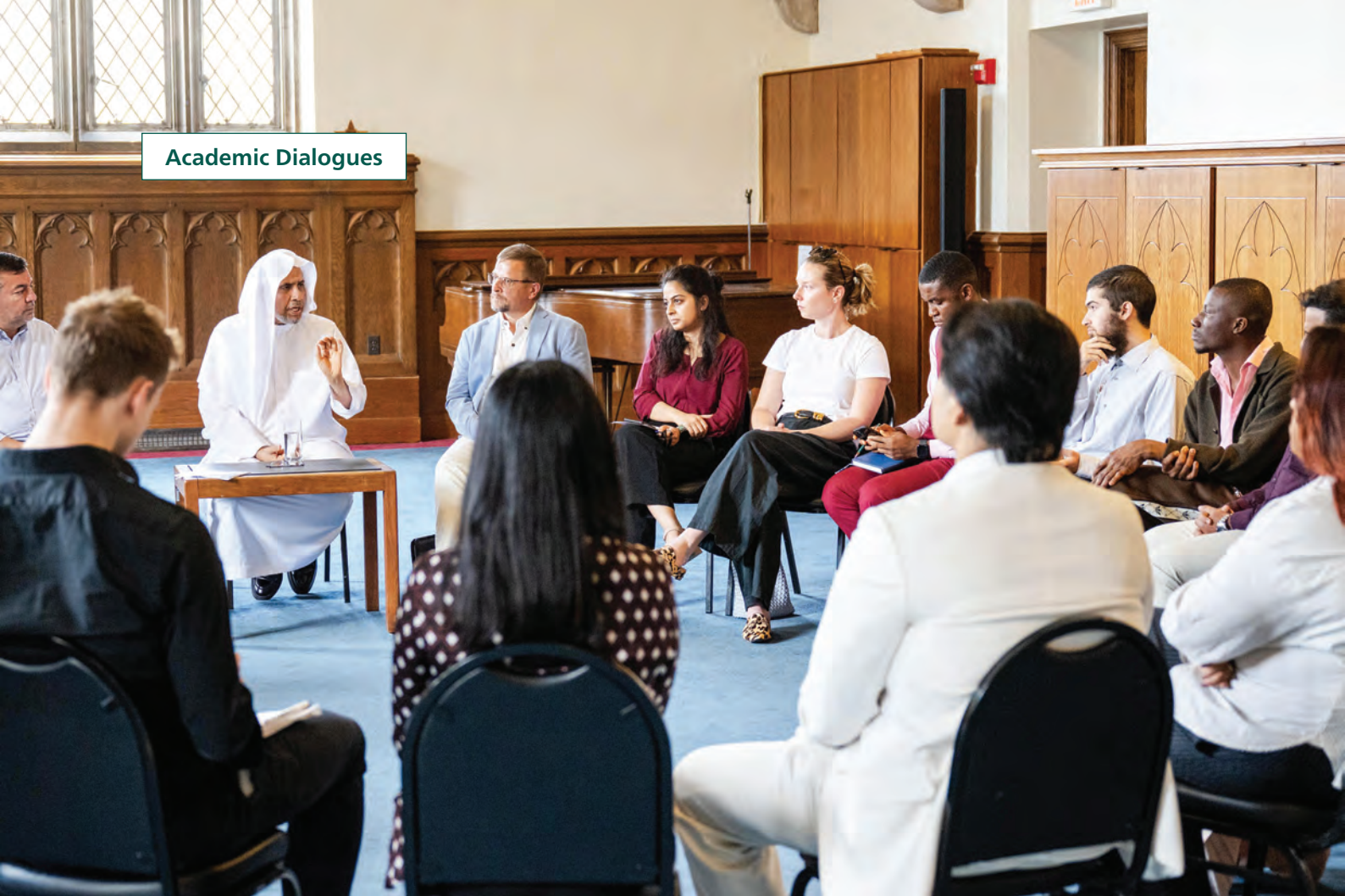
A panel of academics and youth leaders from the university offered their reflections following the lecture.

eral misconceptions and offered a comprehensive discussion of critical topics, including the environment, climate change, family, women, children, and youth. He highlighted the shared values and commonalities among these issues, demonstrating through examples the breadth and diversity of these connections.