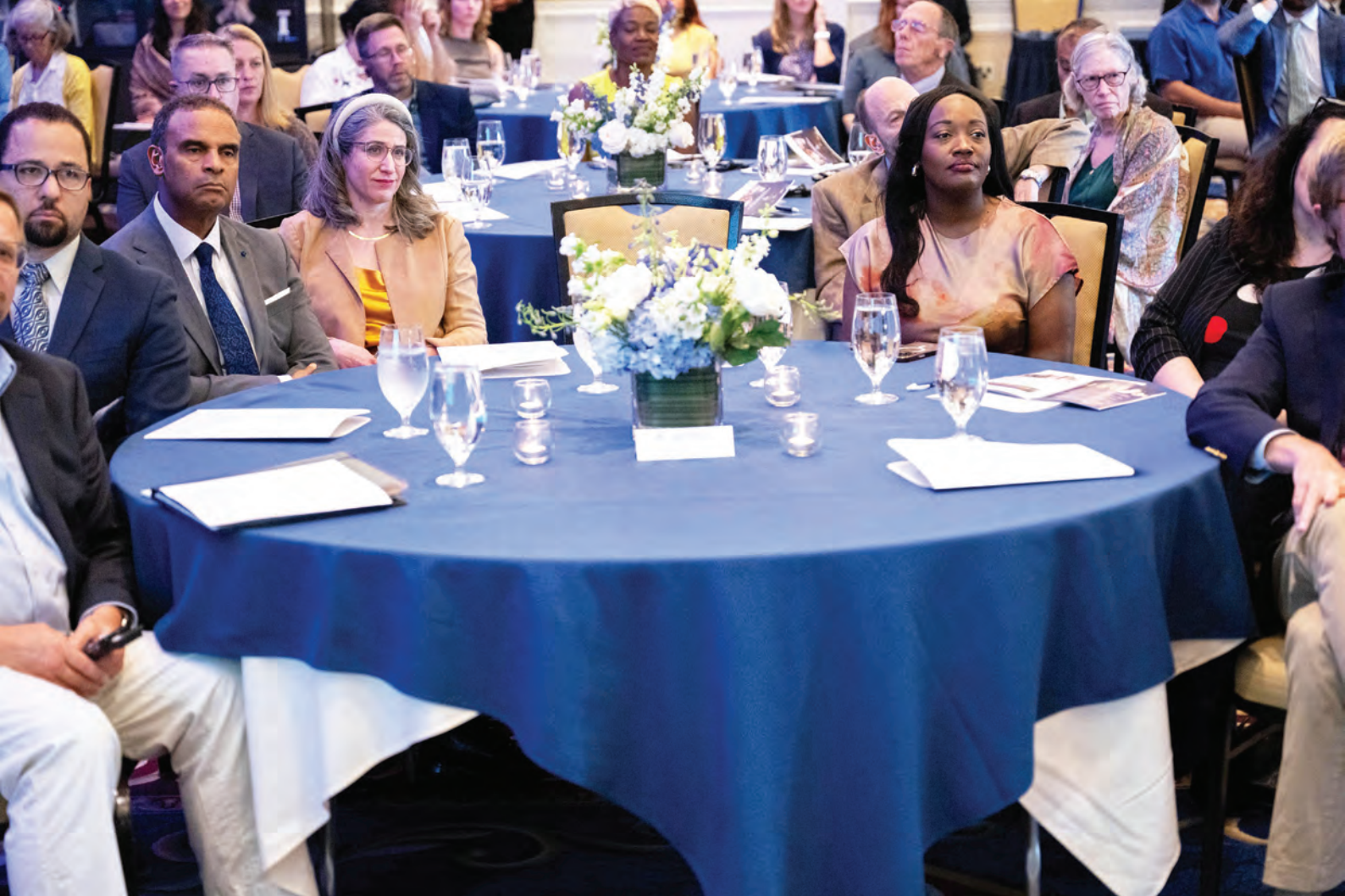
Audience members listening to the Secretary General's lecture at Duke University.