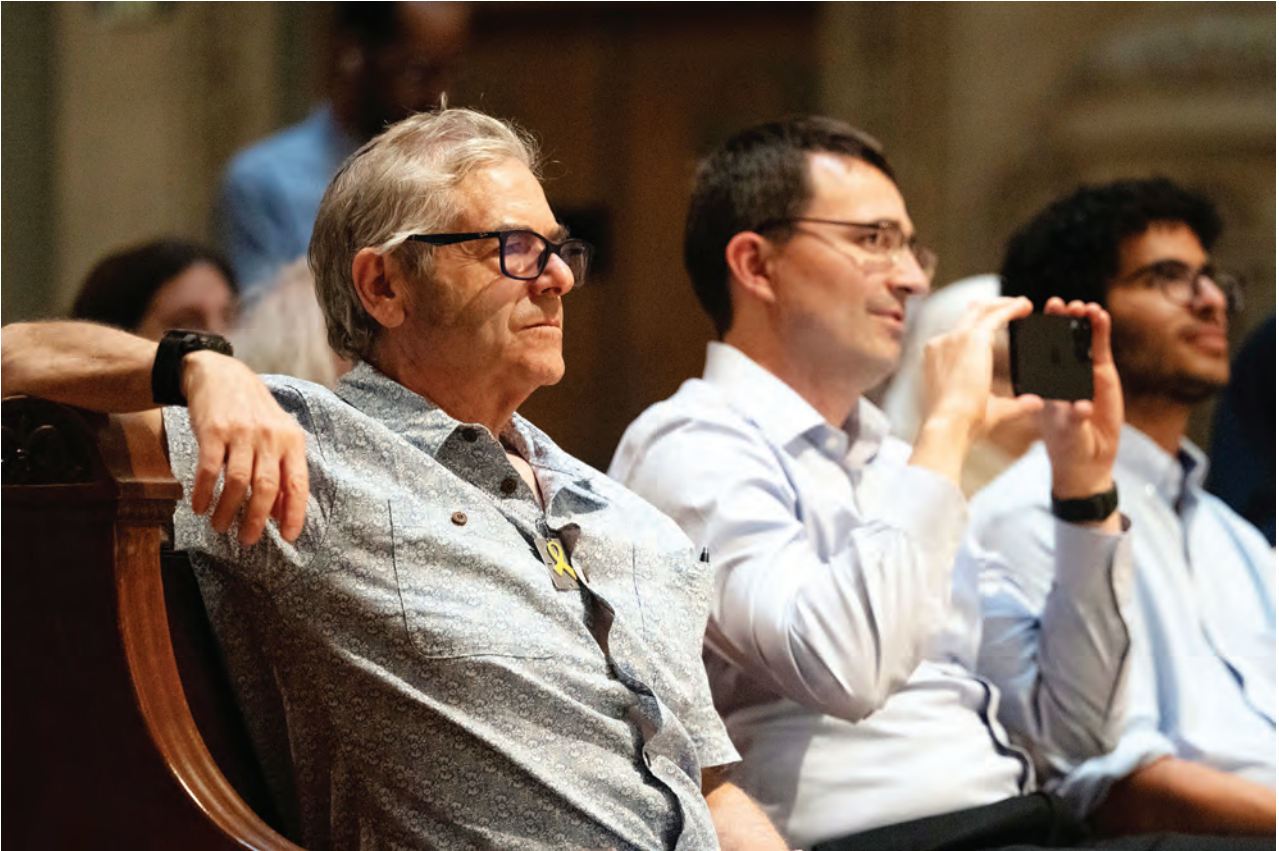
A number of university academics, students, and distinguished invitees attended the event.