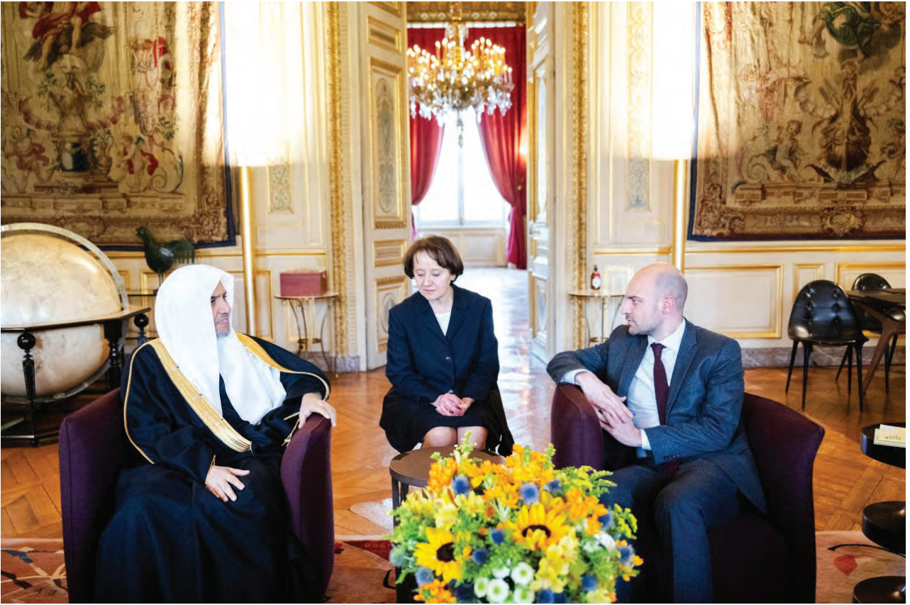
Dr. Al-Issa and French Minister for Foreign Affairs Mr. Jean-Noël Barrot hold talks at the ministry's headquarters.