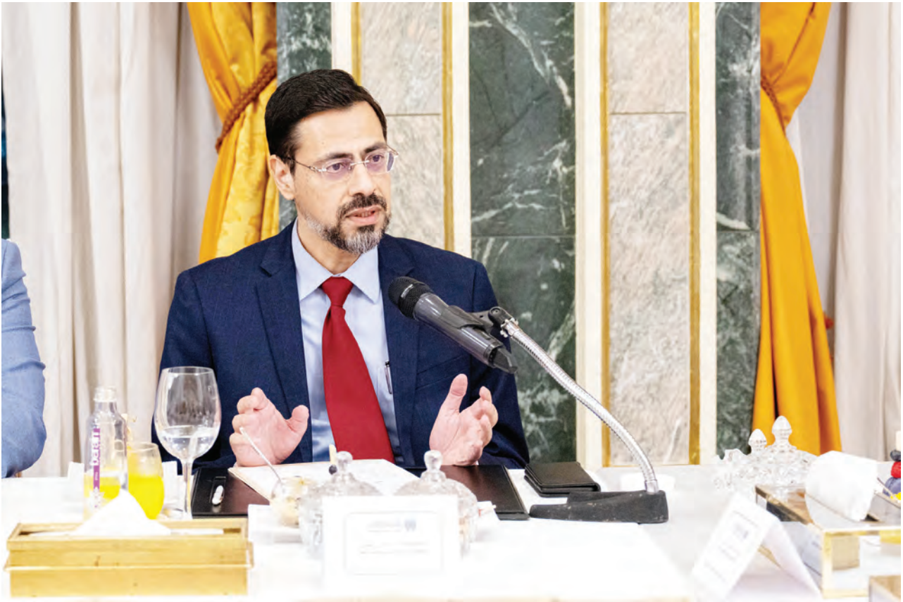
The meeting called for opening a Prophetic Biography Museum branch in London to connect Muslims with the life of their noble Prophet.

et's Biography and Islamic Civilization—also known as the Prophetic Biography Museum—and called for replicating the experience in various countries—including the British capital—given its rich educational content and the powerful messages it conveys through impressive modern technology.