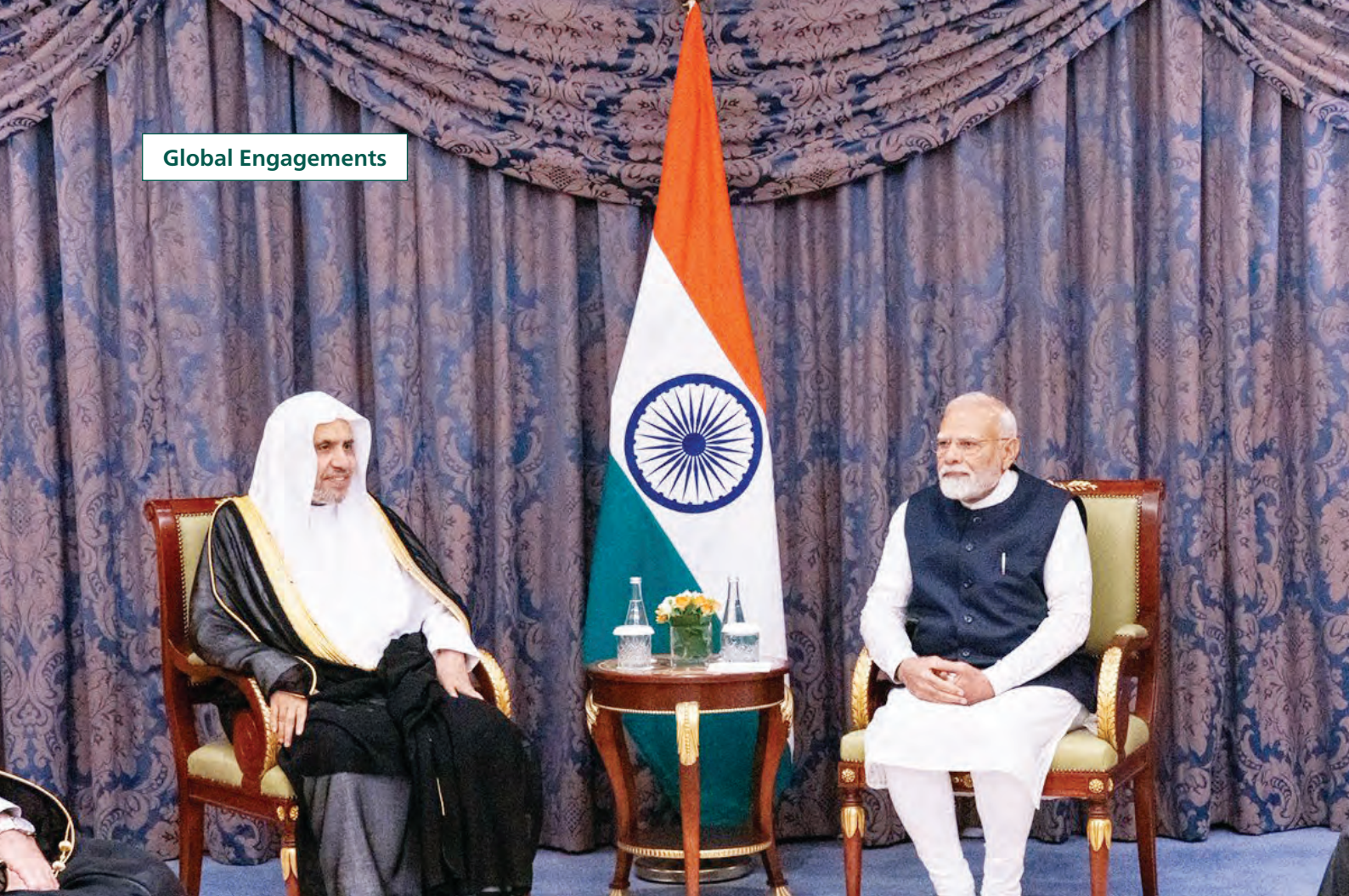
MWL Secretary General Dr. Muhammad Al-Issa meets Prime Minister of India Narendra Modi in Jeddah.