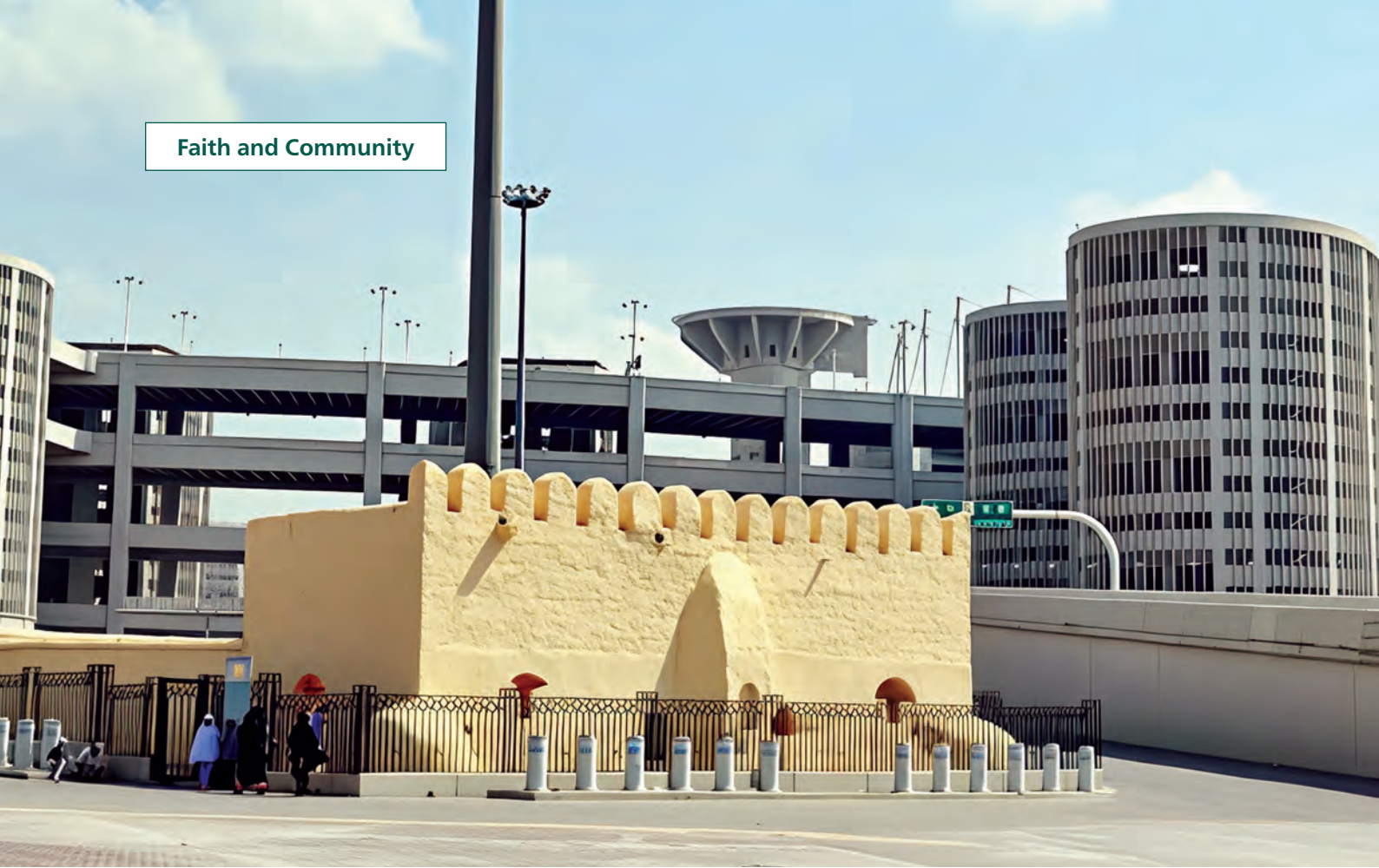
Al-Bay'ah (Pledge) Mosque