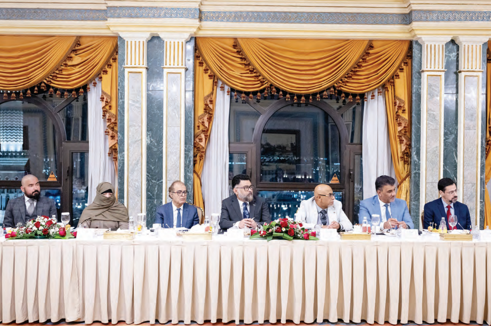
Members of the delegation engaged in the meeting's discussions with the MWL Secretary General.

ing for an immediate end to the genocide inflicted on the people of Gaza, affirming that expressing solidarity with them through all peaceful means is a legitimate right.