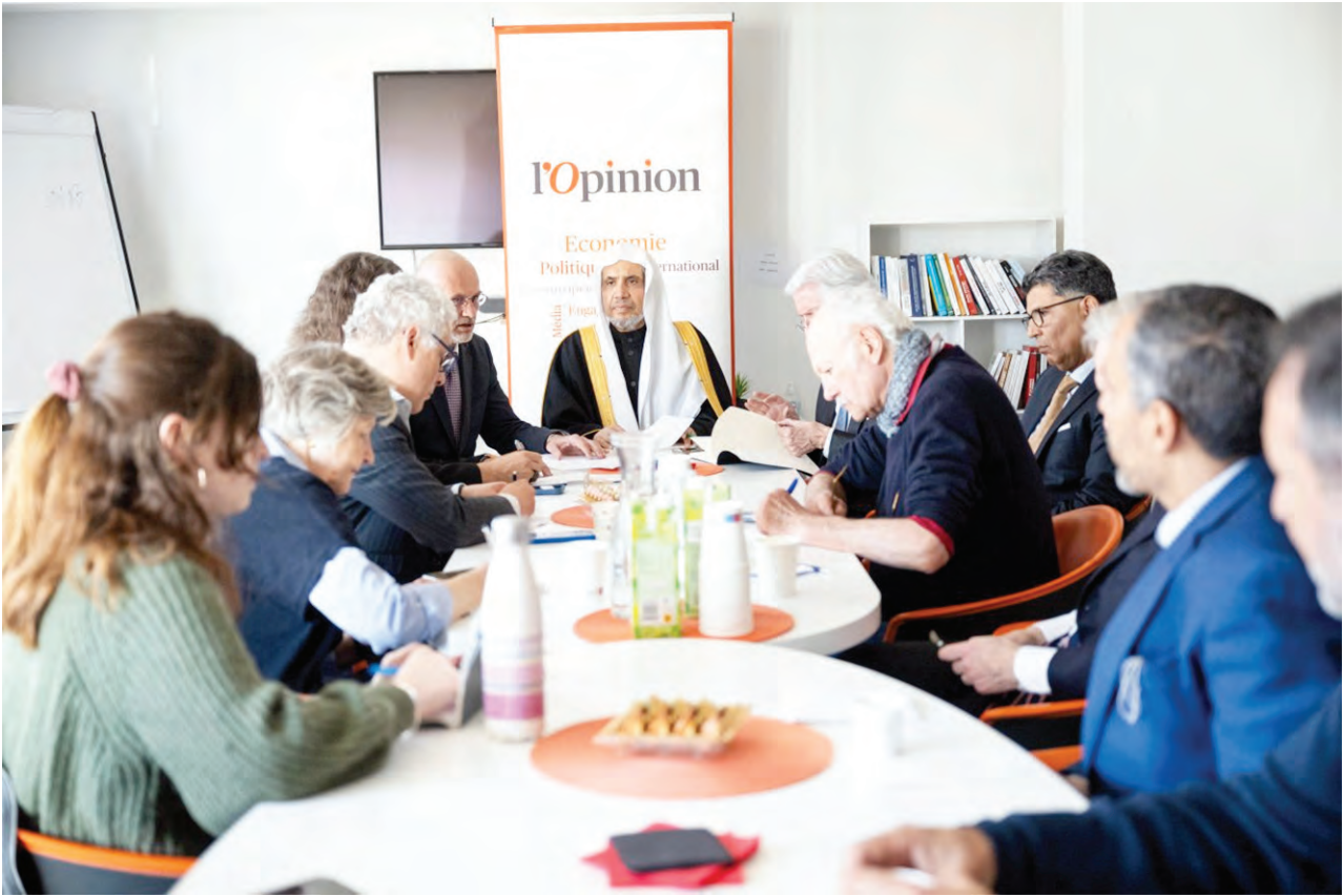
French daily l'Opinion also convened a roundtable with Dr. Al-Issa.

vance Islam's call for peace. In this context, Dr. Al-Issa recalled the MWL's launch, at the United Nations headquarters in New York and in the presence of international organization leaders, of its initiative Building Bridges of Understanding and Cooperation between East and West, affirming that Muslims — throughout their long, rich civilizational history — have engaged and connected with all people, both East and West.” ■