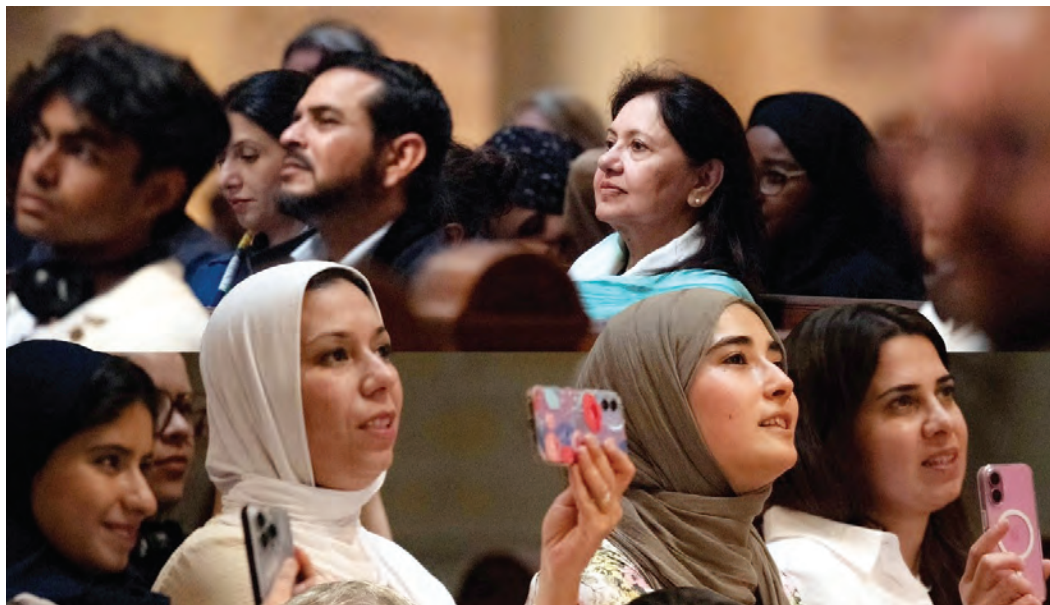
Students and guests attending the Secretary General's lecture at Stanford.