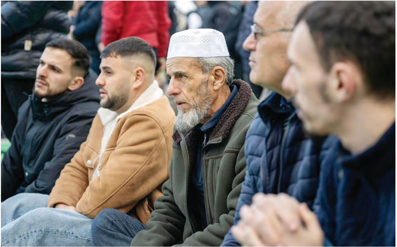
Worshippers listening to the Eid sermon in Tirana.