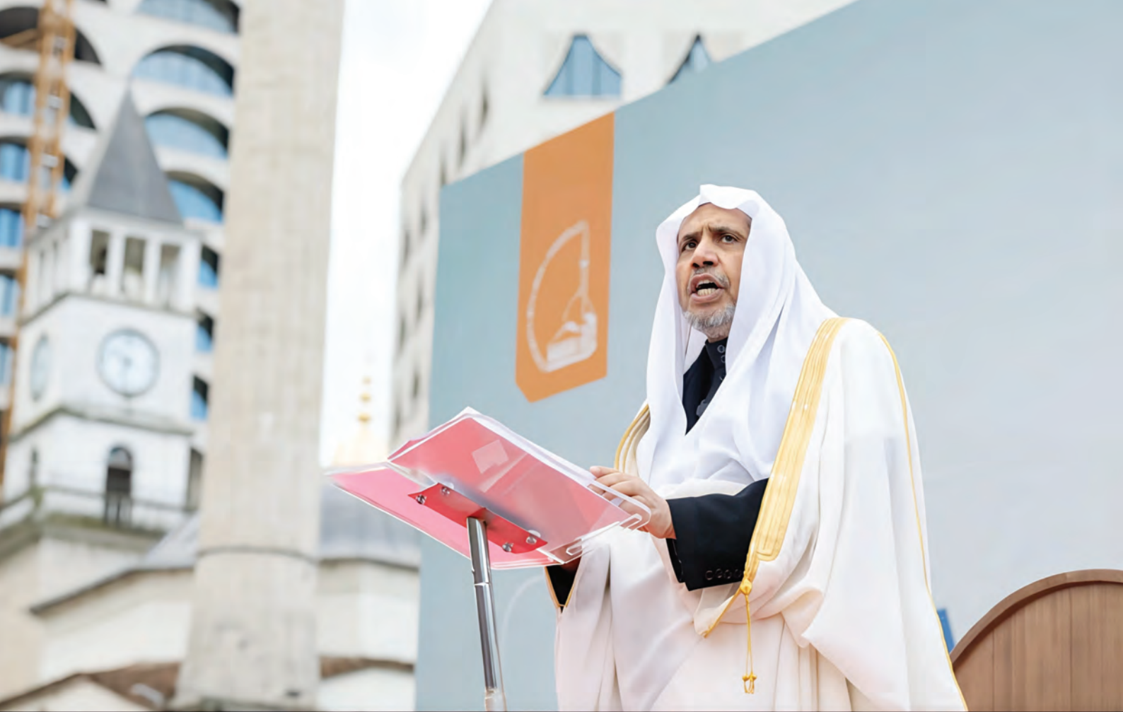
The Secretary General addresses worshippers during the Eid sermon in Tirana.