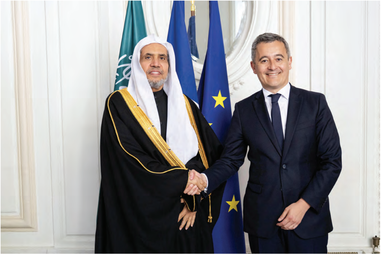
Mr. Gérald Darmanin, Minister of Justice and Keeper of the Seals, welcomes Dr. Al-Issa at the ministry.