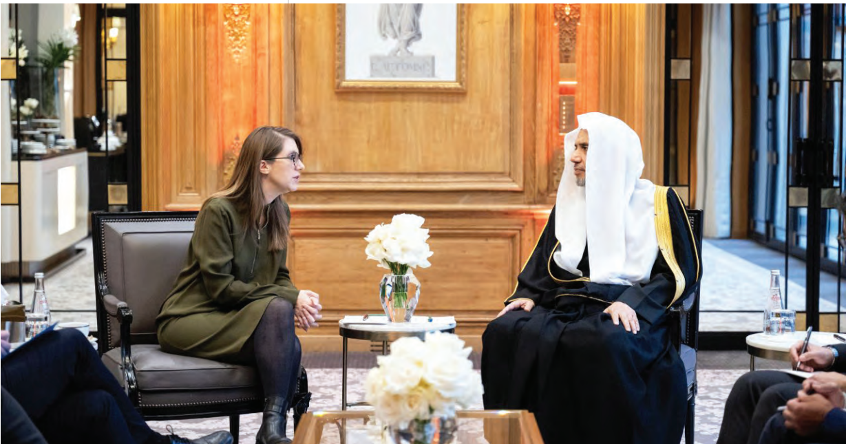
The Secretary General meets with French Minister for Equality and the Fight Against Discrimination Ms. Aurore Bergé.