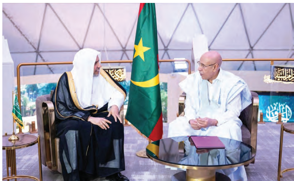
President Mr. Mohamed Ould Ghazouani, and Dr. Muhammad Al-Issa discuss matters of mutual interest following the inauguration of the Prophetic Biography Museum in Nouakchott.

Dr. Al-Issa emphasized that the museum plays a vital role in fostering greater intellectual and spiritual awareness. It presents key events and scenes from the Prophet's life—in full adherence to Islamic guidelines—allowing visitors to experience, in a scholarly and immersive manner, the spiritual essence and uplifting presence of the Prophetic era, as if journeying through its sacred moments. ■