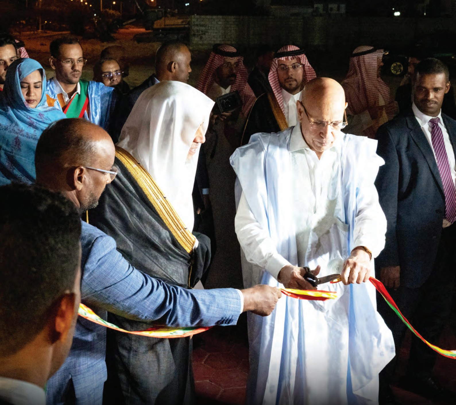
The President of Mauritania and the MWL Secretary General inaugurate the International Fair and Museum of the Prophet's Biography and Islamic Civilization in Nouakchott.