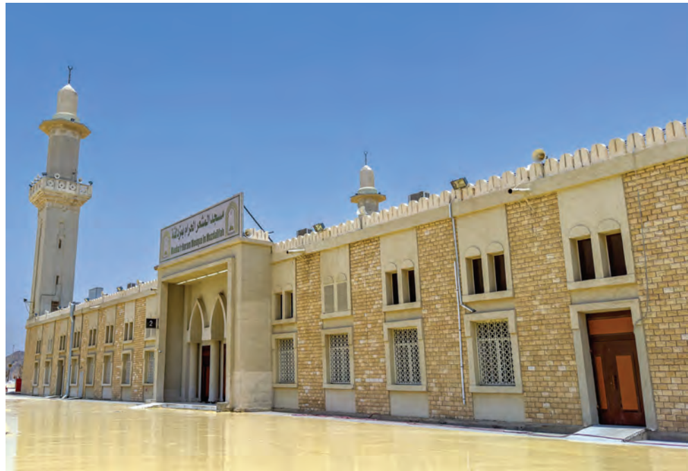
Al-Mash'ar Al-Haram Mosque

Its largest expansion occurred during the Saudi era, at a cost of 237 million riyals. Covering more than 110,000 square meters, the mosque can accommodate 350,000 worshippers. It has six 60-meter-high minarets, three domes, and ten main entrances with 64 doors. A dedicated broadcasting room transmits the sermon and prayers worldwide via satellite.