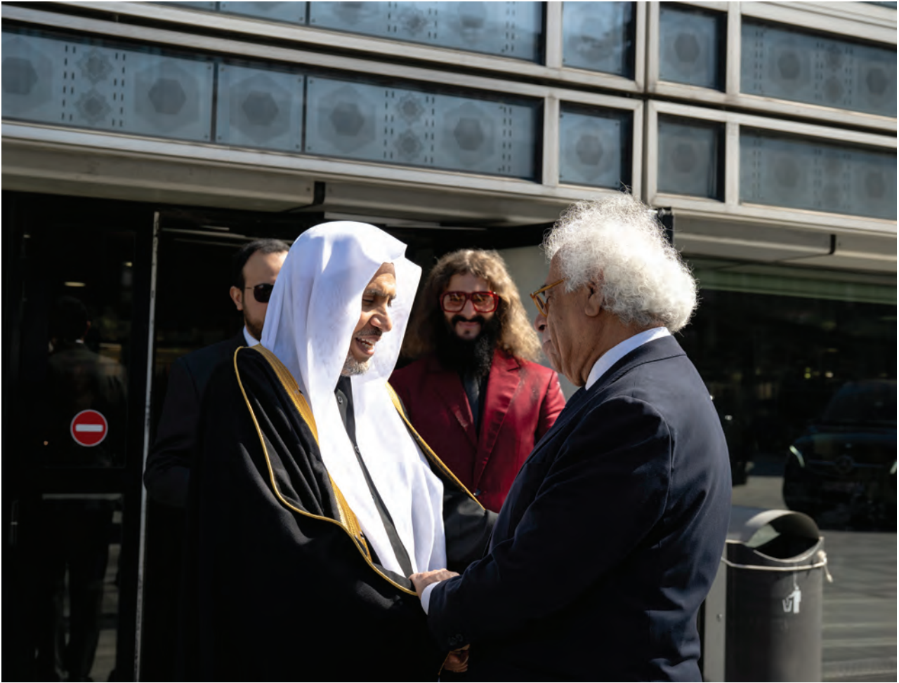
Dr. Al-Issa exchanges greetings with an official outside the Arab World Institute in Paris.

on contemporary issues related to the MWL’s mission, including Islamic legal perspectives, commonly misunderstood religious terms, and the ethics of artificial intelligence.