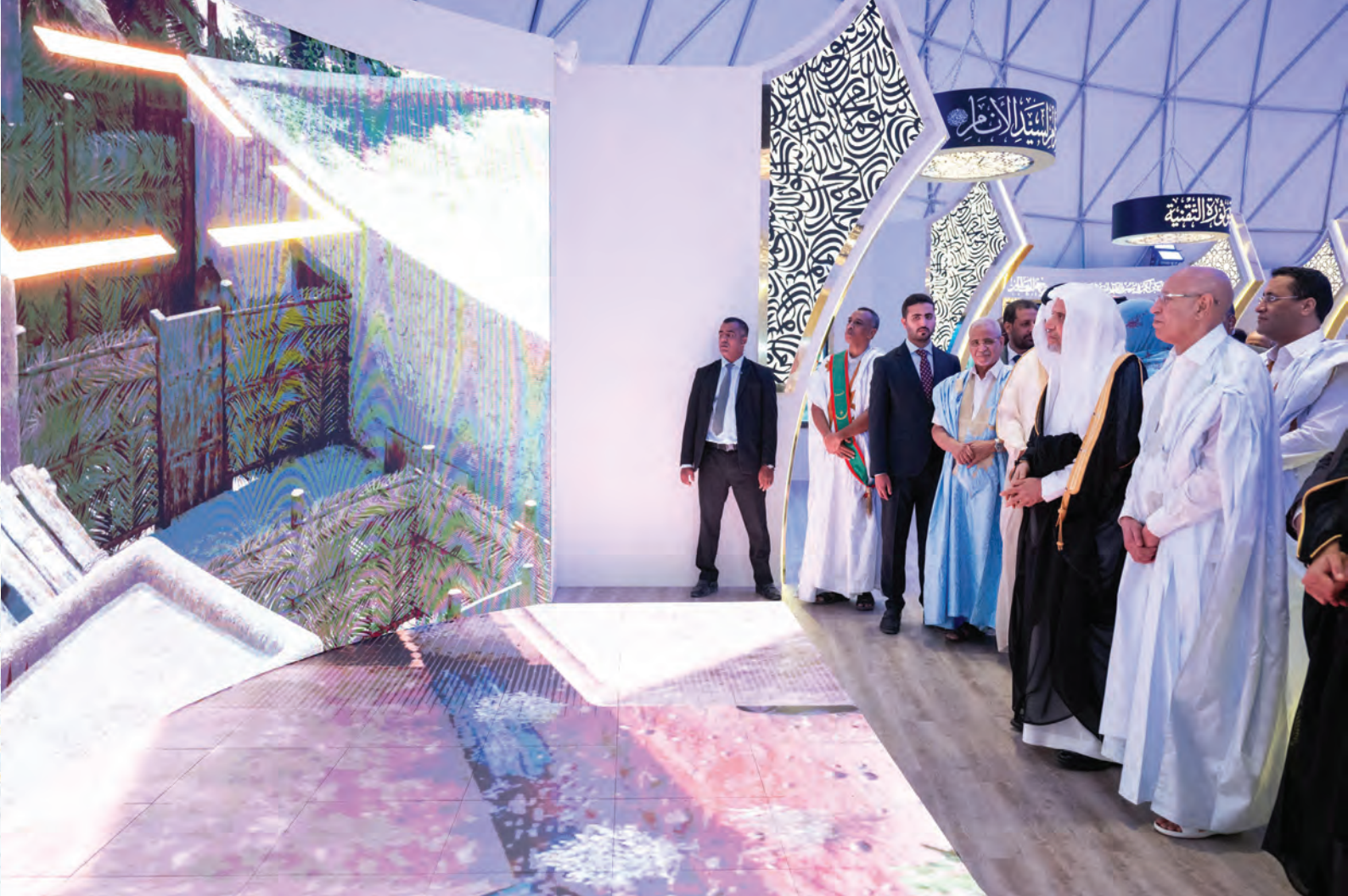
President Ghazouani and Dr. Al-Issa at one of the pavilions of the new International Fair and Museum of the Prophet's Biography and Islamic Civilization in Nouakchott.