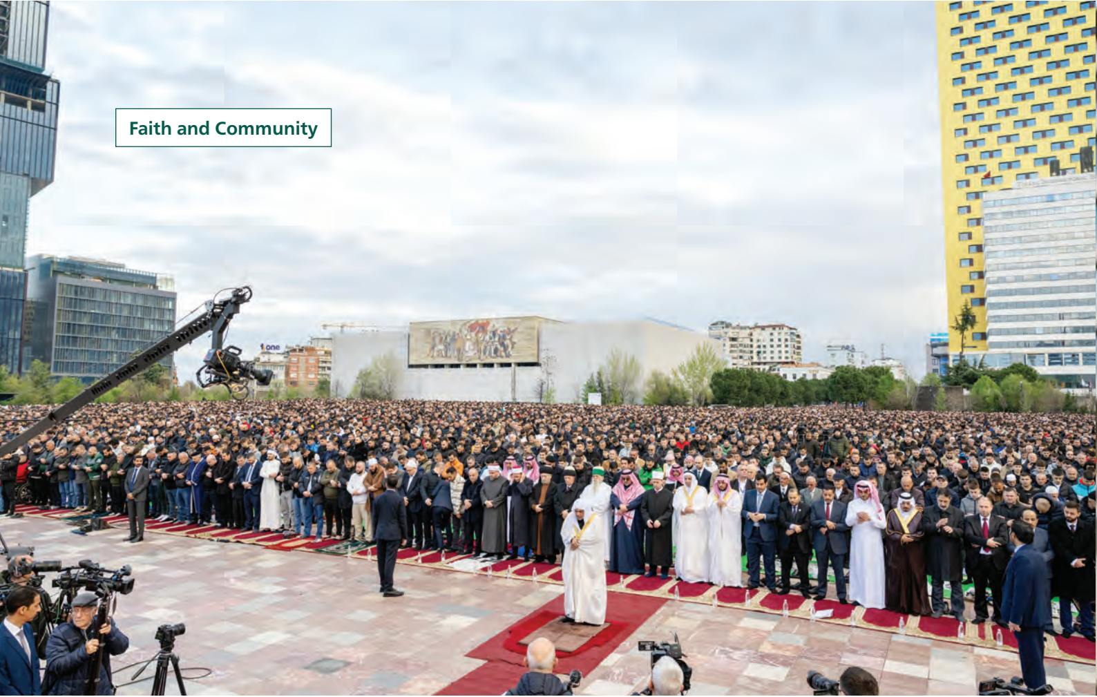
Dr. Al-Issa leading the Eid prayer at the Great Mosque of Tirana.