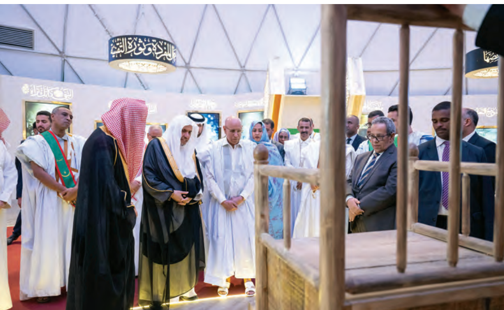
The President and the Secretary General receive a briefing on one of the exhibits.

expansion, which extends from its main headquarters in Madina, Saudi Arabia.