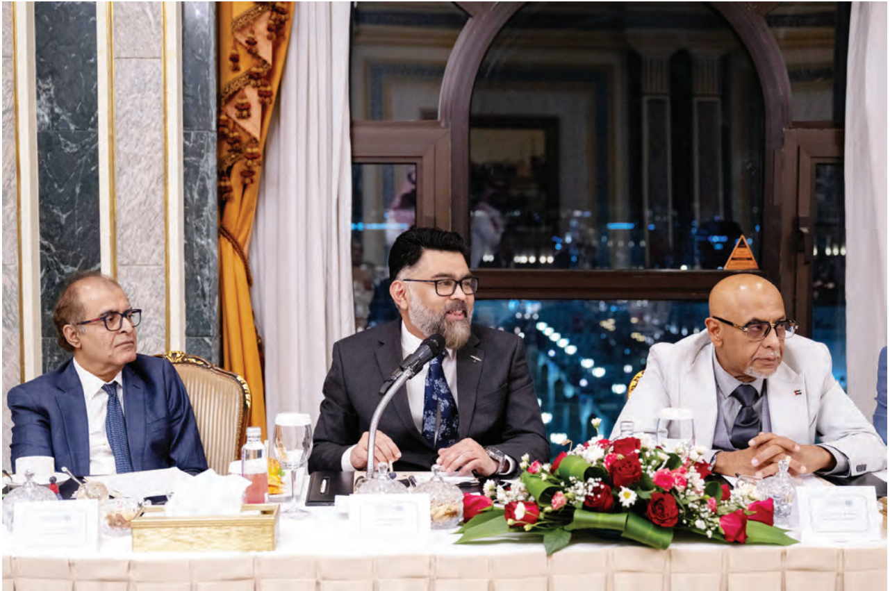
Delegation members praised the transformation brought about by the Charter of Makkah during the meeting.