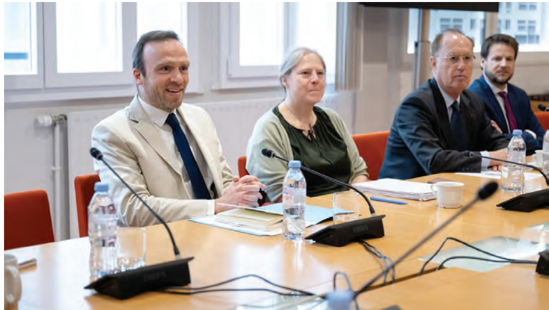
A section of participants during the discussions following the lecture.

vance Islam's call for peace. In this context, Dr. Al-Issa recalled the MWL's launch, at the United Nations headquarters in New York and in the presence of international organization leaders, of its initiative Building Bridges of Understanding and Cooperation between East and West, affirming that Muslims — throughout their long, rich civilizational history — have engaged and connected with all people, both East and West.” ■