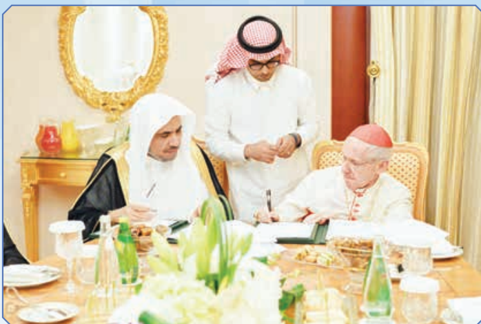
Cooperation agreement between MWL and Vatican to achieve common goals