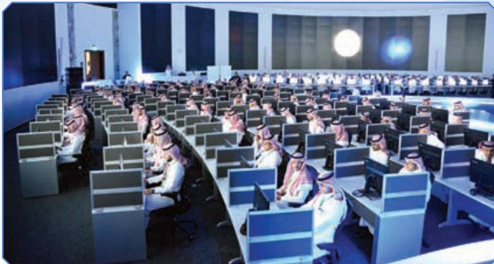
Saudi adds Technology to the work against Terrorism